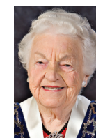
Hazel McCallion Mayor of Mississauga

“Our community is richer when these trained and caring volunteers and staff provide their support and comfort to our terminally-ill neighbors.”